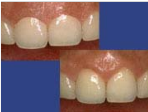
Regrowth of healthy tissue